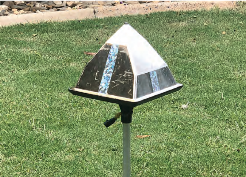
Eagle eye ... The optical bird scarer works by confusing the birds and driving them away from the location.

THE Numurkah recreation reserve now has two new 'weapons' in its arsenal in the fight against the destructive corellas - a gas powered scare gun and 'eagle eye' technology.