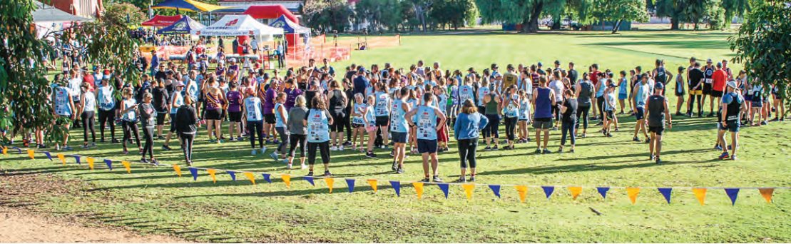
Ready and steady ... Anticipation filled the air as the field assembled for a 9am start.

Money raised from this year's event will go toward the building of a shade structure on the east side of the school's MacKillop Centre.