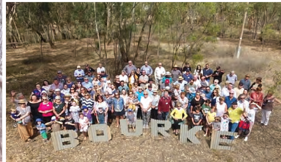
Remembering their ancestors ... Many of the Bourke clan at the family reunion on Sunday, March 8 on the banks of the Broken Creek, not far from the original homestead, Wattleholme.